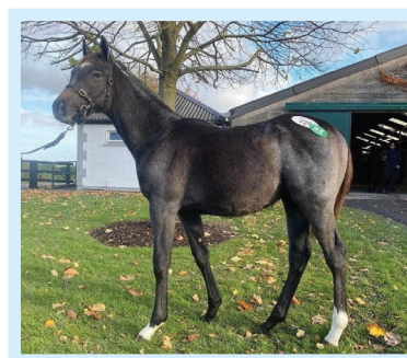
€18,500 sold to Morgan Sheehan at Tattersalls November