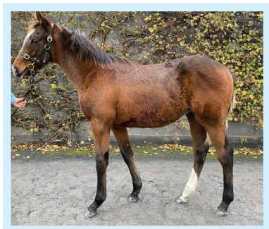
Sold to C&C at Tattersalls November