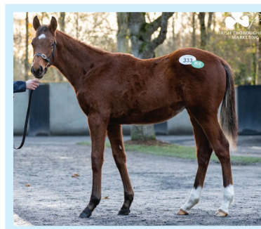
Sold to Tom Weston in Goffs December Sale