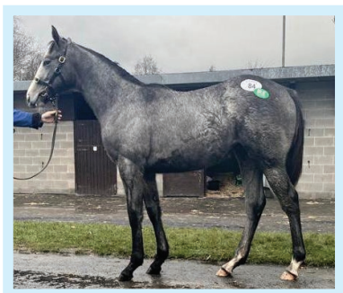
Sold to Gerry Hogan for €25,000 at Goffs December Sale