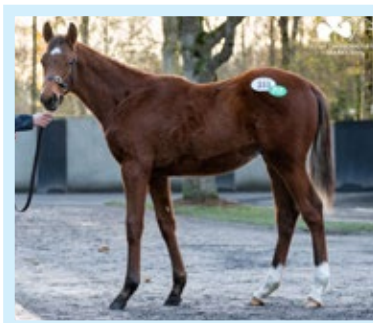
Sold to Tom Weston at Goffs December SALE