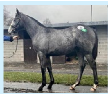
Sold to Gerry Hogan for €25,000 at Goffs