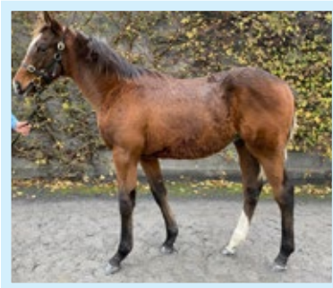
Sold to C&C at Tattersalls

Other Purchasers include Aubury McMahon, Monbeg Stables, Castlefergus Stud, Tomas Janda etc.